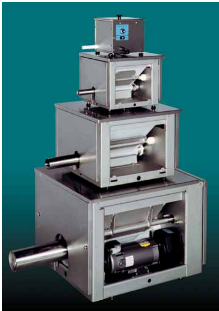
Top to bottom: Models 102, 302, 602 and 902.

The Model 12 is a sanitary design, encompassing quick disassembly features for easy cleaning.