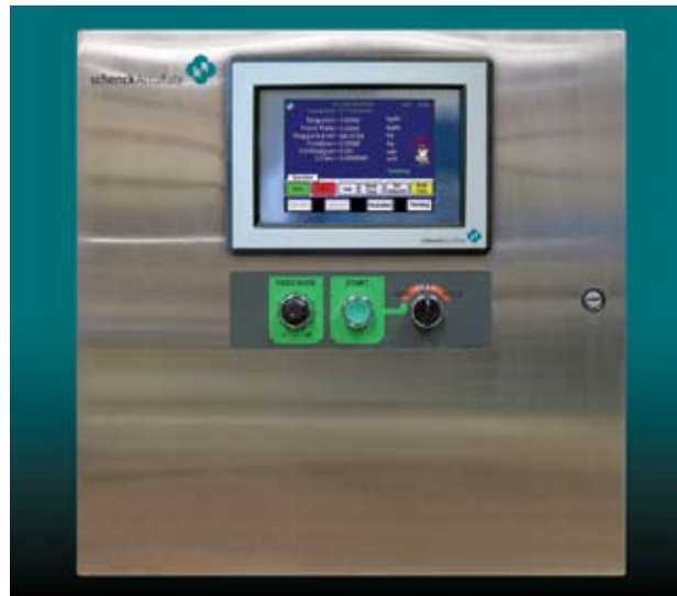
(OP1 shown with non-mechatronic controller)

For more information, please contact us at 1-800-558-0184 or Fax: 262-473-4384 E-mail: mktg@accuratefeeders.com Web site: www.accuratefeeders.com