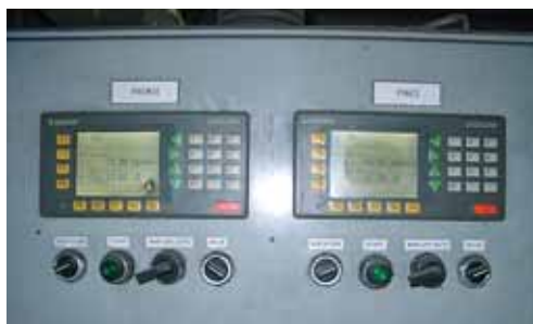
DISOCONT Loss-in-weight Controls.

After a thorough search of feeding equipment manufacturers, Wescast narrowed their choice down to two prospective bulk solids metering equipment suppliers. AccuRate® of Whitewater, Wisconsin, was one of the two remaining manufacturers. AccuRate's local representative, Firing Industries, brought in and demonstrated the MECHATRON® loss-in-weight feeder. During the presentation the Wescast employees were impressed with the feeder's ability to clean, disassemble, and reconfigure from the non-process side. Because the feeder was able to